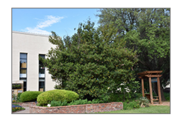
Bay Laurel

620 Goddard Ave. NE Calgary, AB, T2K 5X3 phone: 403-274-4286 www.goldenacre.ca