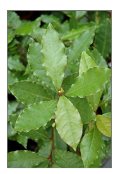
Bay Laurel foliage