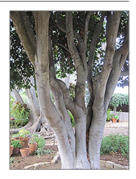
Bay Laurel bark

This tree does best in full sun to partial shade. It does best in average to evenly moist conditions, but will not tolerate standing water. It is not particular as to soil type or pH. It is somewhat tolerant of urban pollution. This species is not originally from North America. It can be propagated by cuttings.