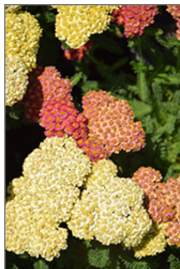
Desert Eve Terracotta Yarrow flowers

Desert Eve Terracotta Yarrow is recommended for the following landscape applications;