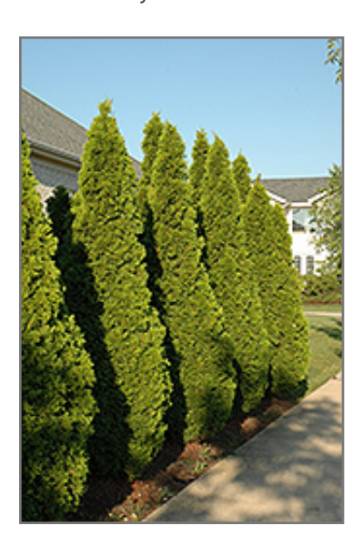
Emerald Green Arborvitae