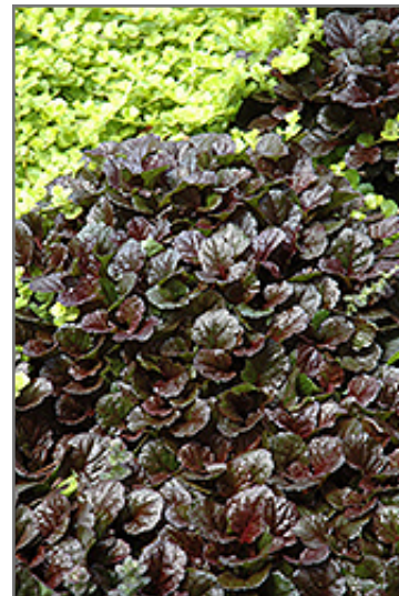
Black Scallop Bugleweed