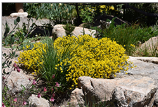
Vancouver Gold Woadwaxen in bloom

Vancouver Gold Woadwaxen will grow to be about 8 inches tall at maturity, with a spread of 4 feet. It tends to fill out right to the ground and therefore doesn't necessarily require facer plants in front. It grows at a fast rate, and under ideal conditions can be expected to live for approximately 20 years.