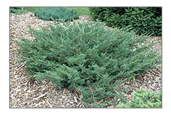
Alpine Carpet Juniper