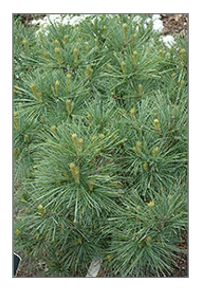
Blue Shag White Pine foliage