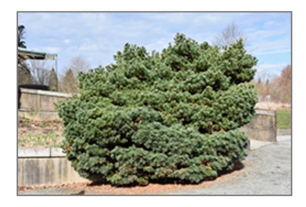
Blue Shag White Pine