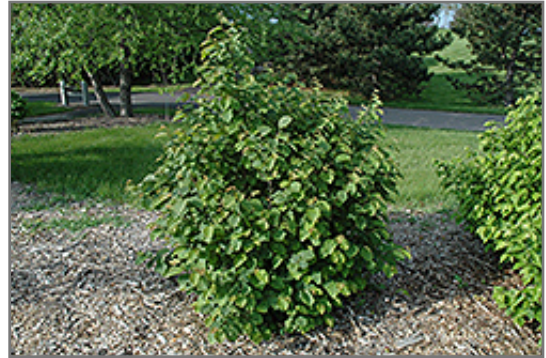
Beaked Hazelnut

This plant is typically grown in a designated edibles garden. It performs well in both full sun and full shade. It is very adaptable to both dry and moist locations, and should do just fine under average home landscape conditions. It is considered to be drought-tolerant, and thus makes an ideal choice for xeriscaping or the moisture-conserving landscape. It is not particular as to soil type or pH. It is highly tolerant of urban pollution and will even thrive in inner city environments. This species is native to parts of North America.