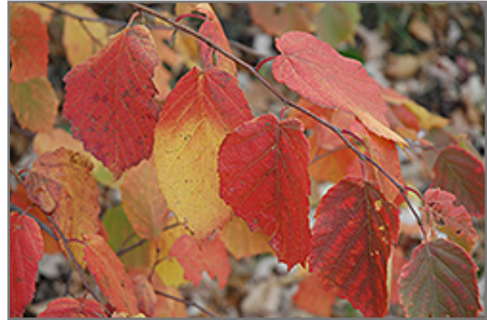
Beaked Hazelnut in fall

This is a multi-stemmed deciduous shrub with an upright spreading habit of growth. Its average texture blends into the landscape, but can be balanced by one or two finer or coarser trees or shrubs for an effective composition. This plant will require occasional maintenance and upkeep, and can be pruned at anytime. It is a good choice for attracting squirrels to your yard. Gardeners should be aware of the following characteristic(s) that may warrant special consideration;