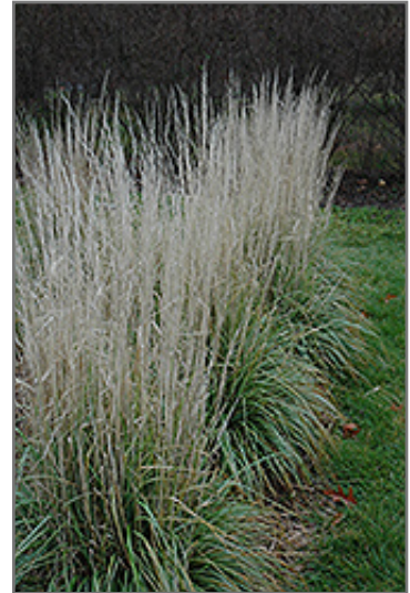
Avalanche Reed Grass in fall

Avalanche Reed Grass is recommended for the following landscape applications;