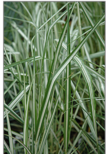
Avalanche Reed Grass foliage

2503-211 Avenue N.E. Edmonton, AB T5Y 6P8