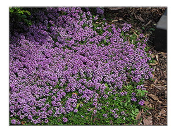
Purple Carpet Creeping Thyme in bloom