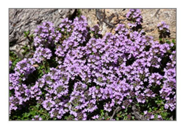
Purple Carpet Creeping Thyme flowers