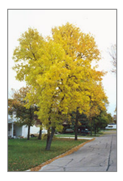
Green Ash in fall