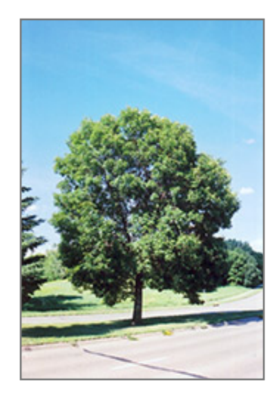
Green Ash