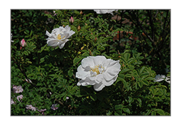
Henry Hudson Rose flowers

Henry Hudson Rose is recommended for the following landscape applications;