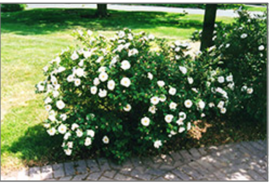
Henry Hudson Rose in bloom