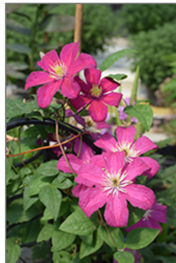
Barbara Harrington Clematis flowers