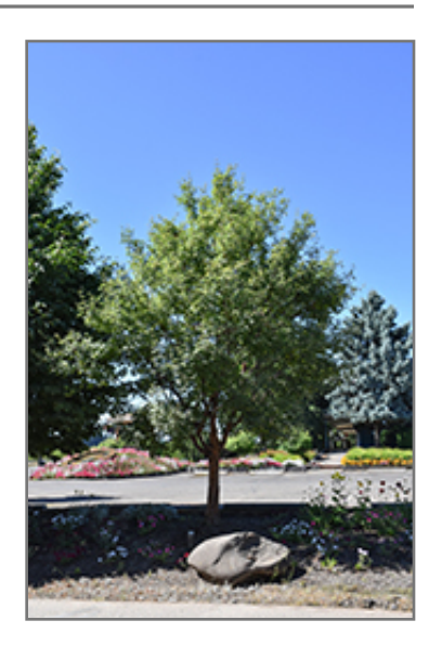
Fireburst Paperbark Maple