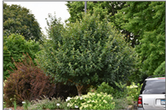
Jade Patina Hedge Maple