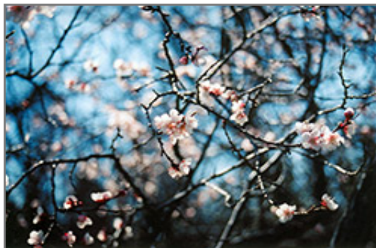
M604 Apricot flowers

M604 Apricot is blanketed in stunning clusters of fragrant shell pink flowers along the branches in early spring, which emerge from distinctive pink flower buds before the leaves. It has green deciduous foliage. The pointy leaves turn yellow in fall. The fruits are showy yellow drupes with gold overtones, which are carried in abundance in late summer. The fruit can be messy if allowed to drop on the lawn or walkways, and may require occasional clean-up.