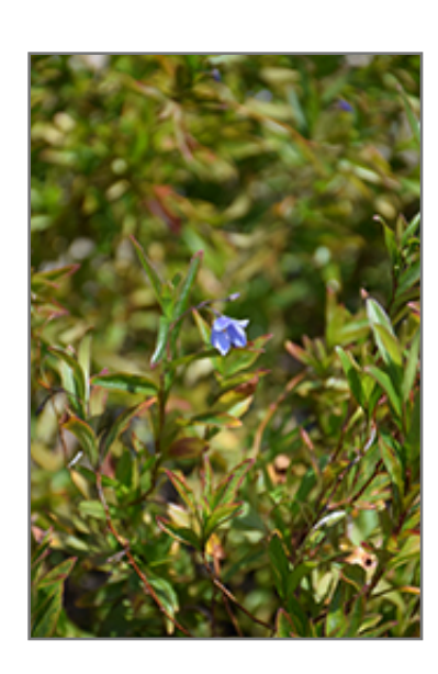
Australian Bluebell Creeper flowers

Australian Bluebell Creeper is a multi-stemmed evergreen shrub with a more or less rounded form. Its average texture blends into the landscape, but can be balanced by one or two finer or coarser trees or shrubs for an effective composition.