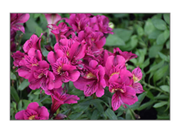
Inca Noble Alstroemeria flowers