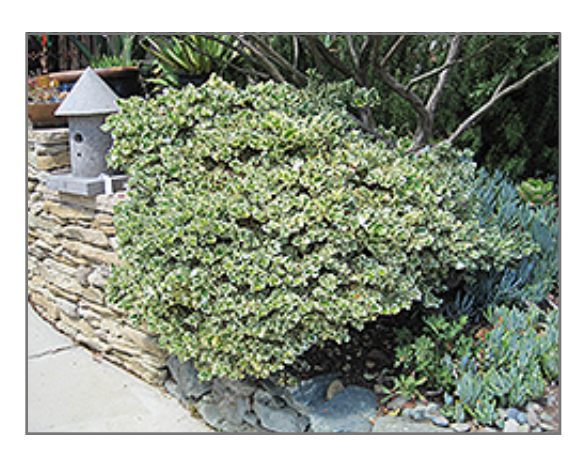
Variegated Carissa

Variegated Carissa is a good choice for the edible garden, but it is also well-suited for use in outdoor pots and containers. With its upright habit of growth, it is best suited for use as a 'thriller' in the 'spiller-thriller-filler' container combination; plant it near the center of the pot, surrounded by smaller plants and those that spill over the edges. It is even sizeable enough that it can be grown alone in a suitable container. Note that when grown in a container, it may not perform exactly as indicated on the tag - this is to be expected. Also note that when growing plants in outdoor containers and baskets, they may require more frequent waterings than they would in the yard or garden.