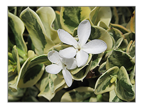
Variegated Carissa flowers

Variegated Carissa has attractive creamy white-variegated dark green foliage with hints of grayish green which emerges buttery yellow in spring on a plant with an upright spreading habit of growth. The glossy round leaves are highly ornamental and remain dark green throughout the winter. It features dainty fragrant white star-shaped flowers along the branches from early to late summer. It produces red berries from early fall to early winter.