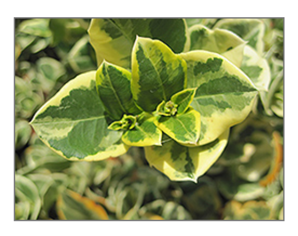
Variegated Carissa foliage