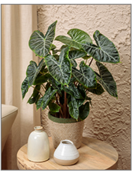
Mythic Nairobi Night Elephant Ears in full

This is an open herbaceous evergreen houseplant with an upright spreading habit of growth. Its relatively coarse texture stands it apart from other indoor plants with finer foliage. This plant usually looks its best without pruning, although it will tolerate pruning.