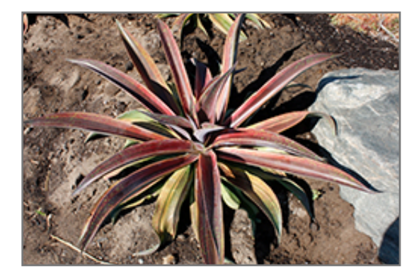
Life On Mars Mangave