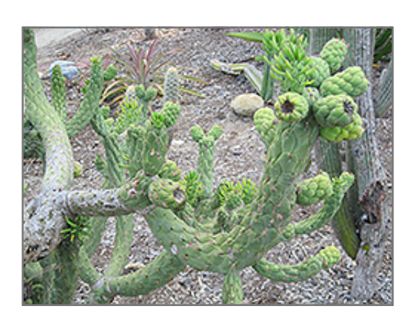
Cane Cactus foliage

Cane Cactus is a member of the cactus family, which are grown primarily for their characteristic shapes, their interesting features and textures, and their high tolerance for hot, dry growing environments. As an 'opuntiad' type of cactus, it doesn't actually have leaves, but rather modified succulent stems that comprise the bulk of the plant, and which are designed to retain water for long periods of time. This particular cactus is valued for its upright and spreading habit of growth on a plant consisting of long, narrow spiny grayish green segmented stems that form 'branches' which spread out from a central base. This plant features showy red cup-shaped flowers at the ends of the branches in early summer. It produces chartreuse berries from early to mid fall.