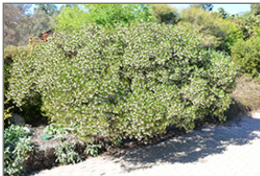
White Lanterns Manzanita in bloom

White Lanterns Manzanita is recommended for the following landscape applications;