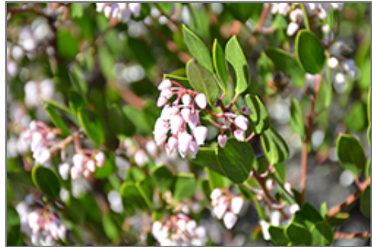
White Lanterns Manzanita flowers

This shrub does best in full sun to partial shade. It is very adaptable to both dry and moist growing conditions, but will not tolerate any standing water. It is very fussy about its soil conditions and must have sandy, acidic soils to ensure success, and is subject to chlorosis (yellowing) of the foliage in alkaline soils, and is able to handle environmental salt. It is somewhat tolerant of urban pollution. This particular variety is an interspecific hybrid.