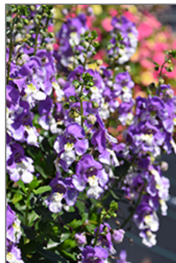
Alonia Big Bicolor Purple Angelonia flowers

This plant will require occasional maintenance and upkeep, and should not require much pruning, except when necessary, such as to remove dieback. It is a good choice for attracting butterflies to your yard, but is not particularly attractive to deer who tend to leave it alone in favor of tastier treats. It has no significant negative characteristics.