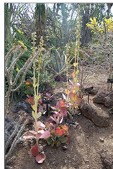
Paddle Plant in bloom