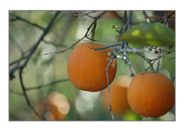
Tarocco Blood Orange fruit