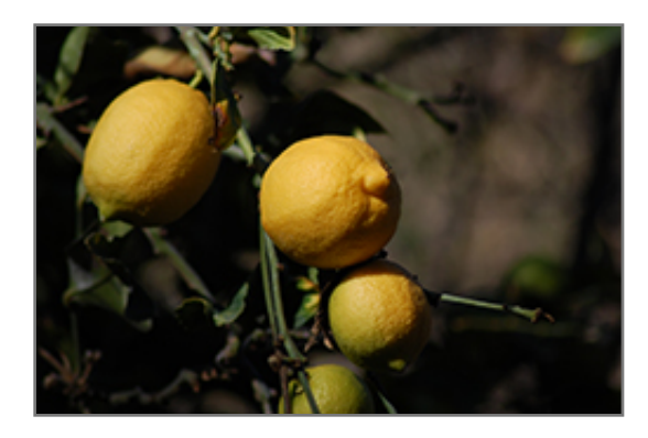
Eureka Lemon fruit

Eureka Lemon features showy clusters of fragrant white star-shaped flowers with buttery yellow eyes at the ends of the branches from early spring to late winter, which emerge from distinctive lilac purple flower buds. It has attractive dark green evergreen foliage. The glossy oval leaves are highly ornamental and remain dark green throughout the winter. It features an abundance of magnificent yellow berries from early spring to late winter.