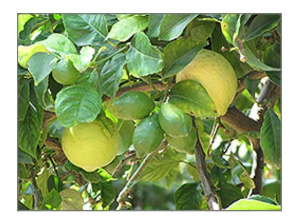
Eureka Lemon fruit

8546 Sun Valley Road Anytown, USA 12345 204.782.4147