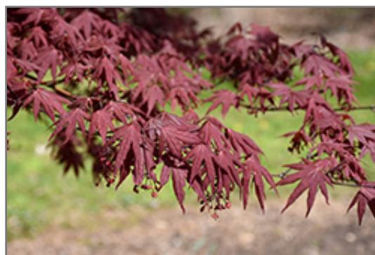
Hefner's Red Select Japanese Maple foliage