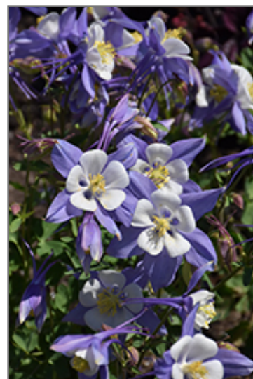
Songbird Blue Jay Columbine flowers

Songbird Blue Jay Columbine is an herbaceous perennial with an upright spreading habit of growth. Its medium texture blends into the garden, but can always be balanced by a couple of finer or coarser plants for an effective composition.