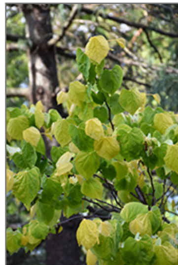
Solar Eclipse Redbud foliage

This tree does best in full sun to partial shade. It prefers to grow in average to moist conditions, and shouldn't be allowed to dry out. It is not particular as to soil type or pH. It is highly tolerant of urban pollution and will even thrive in inner city environments, and will benefit from being planted in a relatively sheltered location. Consider applying a thick mulch around the root zone in winter to protect it in exposed locations or colder microclimates. This is a selection of a native North American species.