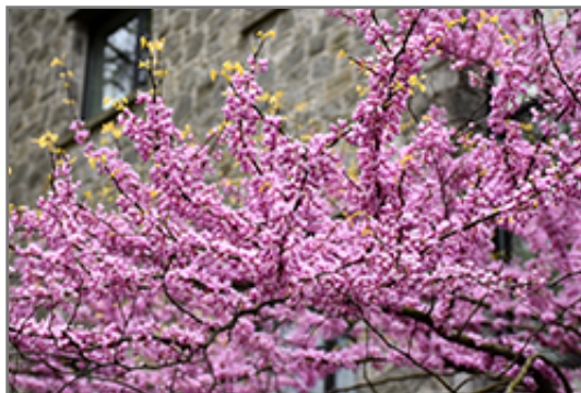
Solar Eclipse Redbud flowers

This is a relatively low maintenance tree, and should only be pruned after flowering to avoid removing any of the current season's flowers. Deer don't particularly care for this plant and will usually leave it alone in favor of tastier treats. Gardeners should be aware of the following characteristic(s) that may warrant special consideration;