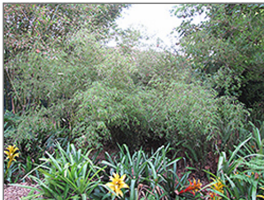
Narrow-Leaved Clumping Bamboo

Narrow-Leaved Clumping Bamboo is a fine choice for the garden, but it is also a good selection for planting in outdoor pots and containers. Because of its height, it is often used as a 'thriller' in the 'spiller-thriller-filler' container combination; plant it near the center of the pot, surrounded by smaller plants and those that spill over the edges. It is even sizeable enough that it can be grown alone in a suitable container. Note that when growing plants in outdoor containers and baskets, they may require more frequent waterings than they would in the yard or garden.