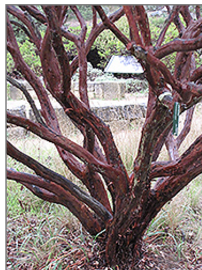
Big Berry Manzanita bark