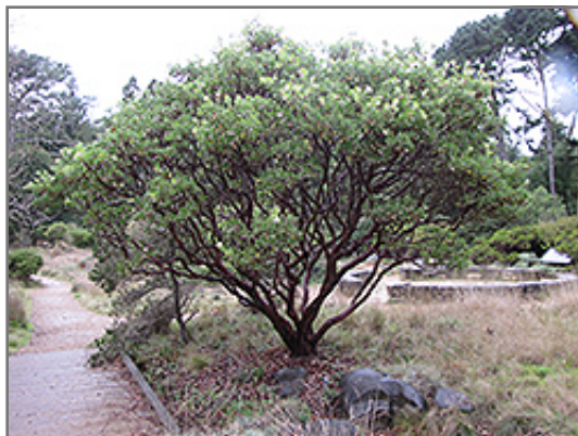
Big Berry Manzanita in bloom

Big Berry Manzanita makes a fine choice for the outdoor landscape, but it is also well-suited for use in outdoor pots and containers. Its large size and upright habit of growth lend it for use as a solitary accent, or in a composition surrounded by smaller plants around the base and those that spill over the edges. It is even sizeable enough that it can be grown alone in a suitable container. Note that when grown in a container, it may not perform exactly as indicated on the tag - this is to be expected. Also note that when growing plants in outdoor containers and baskets, they may require more frequent waterings than they would in the yard or garden.