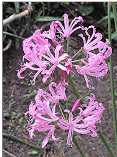
Bowden Cornish Lily flowers

Bowden Cornish Lily is recommended for the following landscape applications;