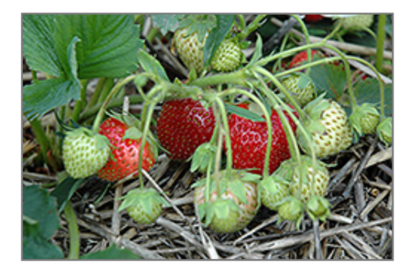
Lateglow Strawberry fruit