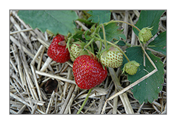
Everest Strawberry fruit