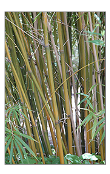
Rockledge Bamboo bark