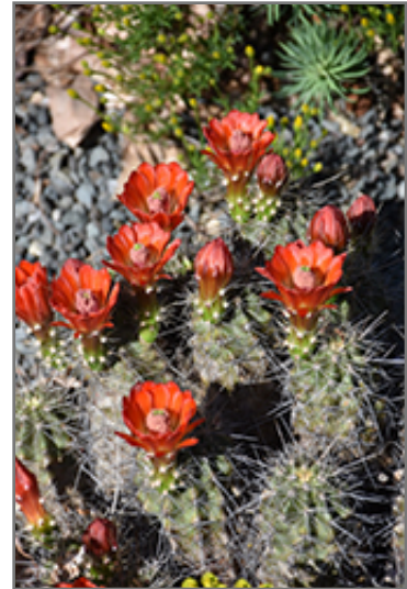
Mexican Claret Cup flowers

This is a relatively low maintenance plant, and should never be pruned except to remove any dieback, as it tends not to take pruning well. Deer don't particularly care for this plant and will usually leave it alone in favor of tastier treats. Gardeners should be aware of the following characteristic(s) that may warrant special consideration;