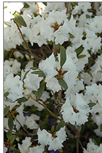
April Snow Rhododendron flowers