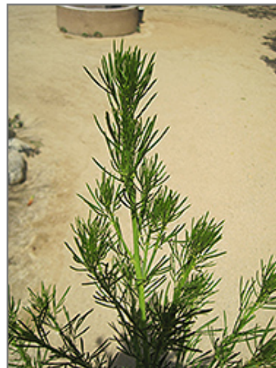
African Scurf Pea foliage

This shrub should only be grown in full sunlight. It does best in average to evenly moist conditions, but will not tolerate standing water. It is not particular as to soil type or pH. It is somewhat tolerant of urban pollution. This species is not originally from North America.