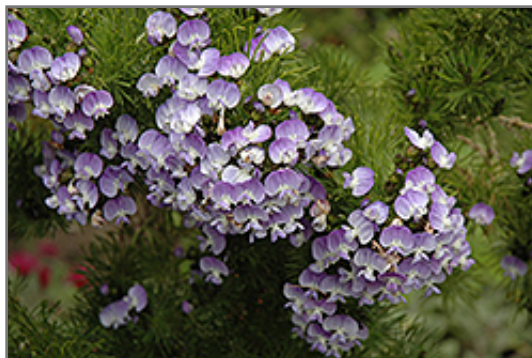
African Scurf Pea flowers