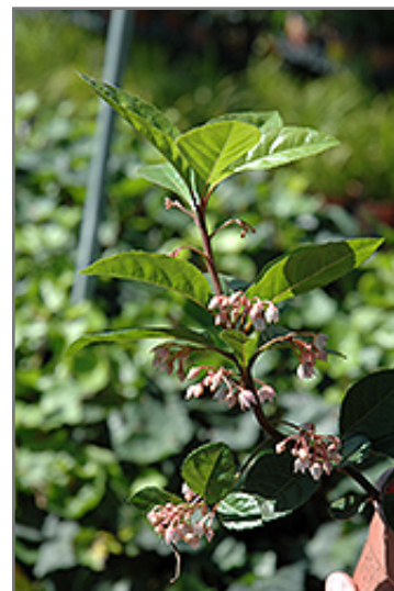
Japanese Ardisia flowers