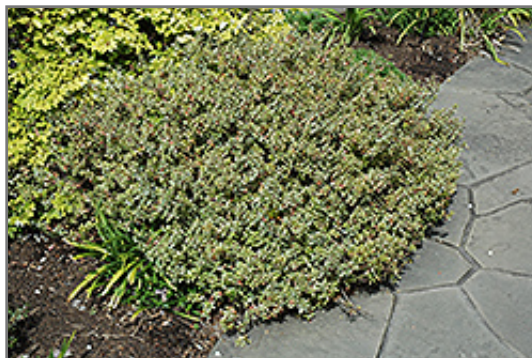
Silver Anniversary Glossy Abelia

This shrub will require occasional maintenance and upkeep, and should only be pruned after flowering to avoid removing any of the current season's flowers. It is a good choice for attracting birds, bees and butterflies to your yard, but is not particularly attractive to deer who tend to leave it alone in favor of tastier treats. It has no significant negative characteristics.