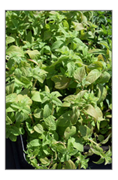
Banana Mint