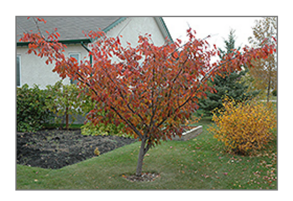
Pembina Plum in fall

This tree is typically grown in a designated area of the yard because of its mature size and spread. It should only be grown in full sunlight. It does best in average to evenly moist conditions, but will not tolerate standing water. It is not particular as to soil type or pH. It is highly tolerant of urban pollution and will even thrive in inner city environments. This particular variety is an interspecific hybrid.