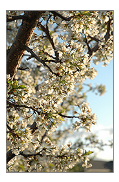
Pembina Plum flowers