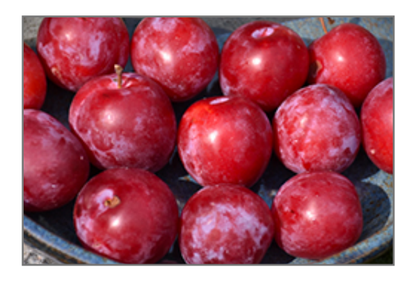
Pembina Plum fruit

Pembina Plum is covered in stunning clusters of fragrant white flowers along the branches in early spring before the leaves. It has forest green deciduous foliage. The pointy leaves turn yellow in fall. The fruits are showy red drupes carried in abundance in late summer. The fruit can be messy if allowed to drop on the lawn or walkways, and may require occasional clean-up.