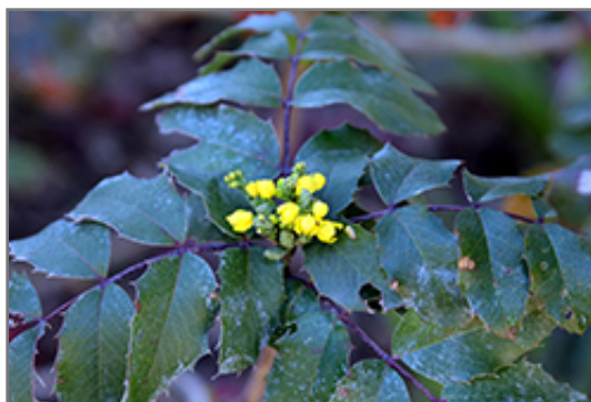
Mission Canyon Barberry flowers

This shrub will require occasional maintenance and upkeep, and can be pruned at anytime. It is a good choice for attracting birds and bees to your yard, but is not particularly attractive to deer who tend to leave it alone in favor of tastier treats. Gardeners should be aware of the following characteristic(s) that may warrant special consideration;