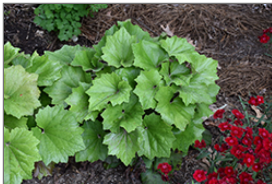
Last Dance Rayflower