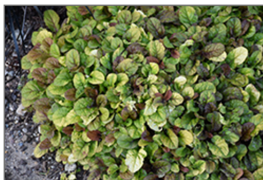
Feathered Friends Parrot Paradise Bugleweed