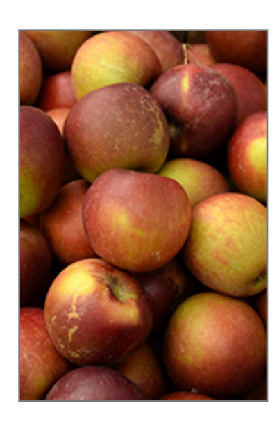
Arkansas Black Apple fruit

Arkansas Black Apple features showy clusters of lightly-scented white flowers with shell pink overtones along the branches in mid spring, which emerge from distinctive pink flower buds. It has forest green deciduous foliage. The pointy leaves turn yellow in fall. The fruits are showy dark red apples with black overtones, which are carried in abundance in early fall. The fruit can be messy if allowed to drop on the lawn or walkways, and may require occasional clean-up.