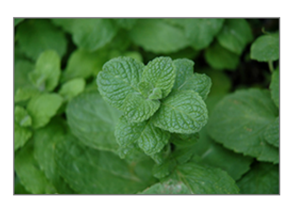
Apple Mint foliage

Apple Mint features bold spikes of white flowers rising above the foliage in mid summer. Its attractive fragrant pointy leaves remain green in color throughout the season.