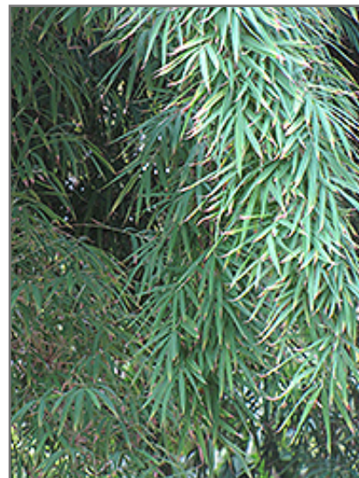
Chocolate Bamboo foliage

Chocolate Bamboo is a fine choice for the garden, but it is also a good selection for planting in outdoor pots and containers. Because of its height, it is often used as a 'thriller' in the 'spiller-thriller-filler' container combination; plant it near the center of the pot, surrounded by smaller plants and those that spill over the edges. It is even sizeable enough that it can be grown alone in a suitable container. Note that when growing plants in outdoor containers and baskets, they may require more frequent waterings than they would in the yard or garden.