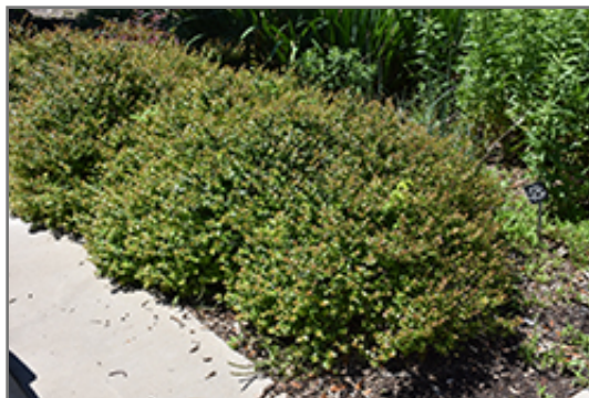
Rose Creek Abelia

Rose Creek Abelia will grow to be about 4 feet tall at maturity, with a spread of 5 feet. It tends to fill out right to the ground and therefore doesn't necessarily require facer plants in front. It grows at a slow rate, and under ideal conditions can be expected to live for approximately 30 years.