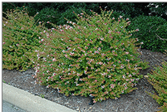
Rose Creek Abelia in bloom

This shrub will require occasional maintenance and upkeep, and should only be pruned after flowering to avoid removing any of the current season's flowers. It is a good choice for attracting birds, bees and butterflies to your yard, but is not particularly attractive to deer who tend to leave it alone in favor of tastier treats. It has no significant negative characteristics.